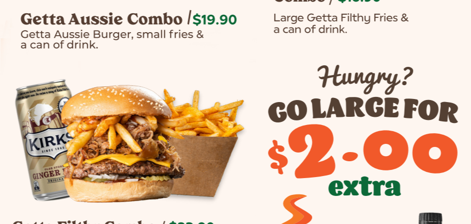
Getta Aussie Combo / $19.90 Getta Aussie Burger, small fries & a can of drink.