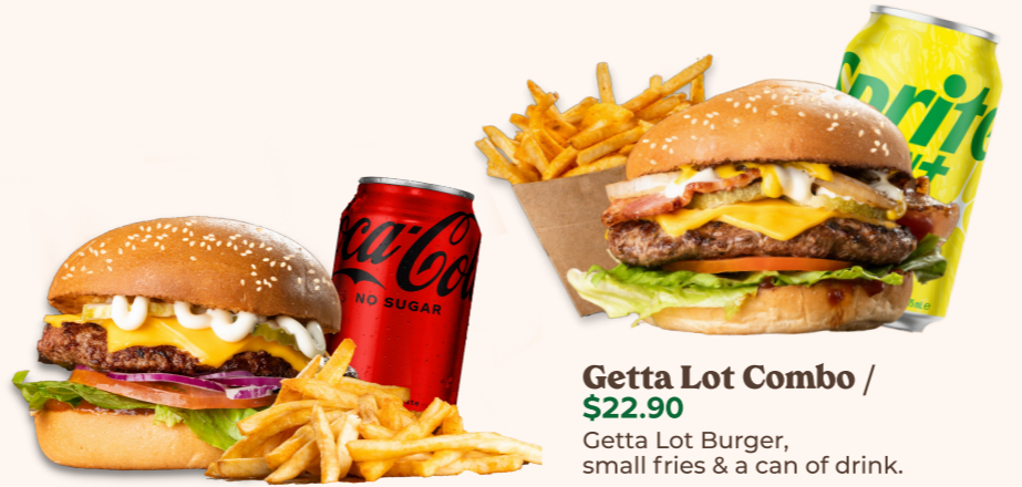
Getta Lot Combo / $22.90 Getta Lot Burger, small fries & a can of drink.