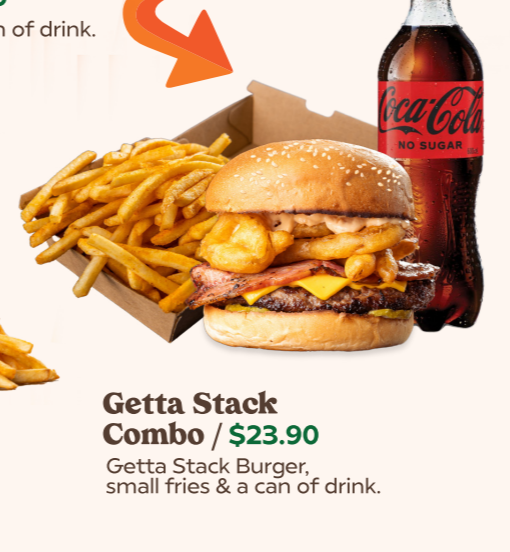
Getta Stack Combo / $23.90 Getta Stack Burger, small fries & a can of drink.